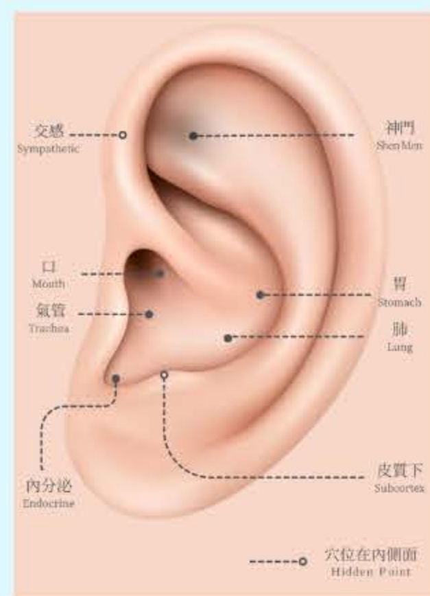
穴位示意圖 Acupuncture Points Chart

The Chinese Medical Practitioners (CMPs) will use 75% medical alcohol to disinfect the ear points and the surrounding area. They will hold the ear with one hand and firmly attach the patches to the specific ear points with the other hand.